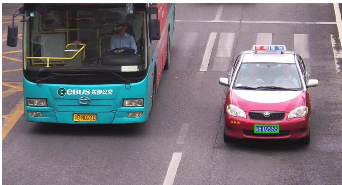
80 kilometers per hour Xiangmi Licensing license plate recognition capture