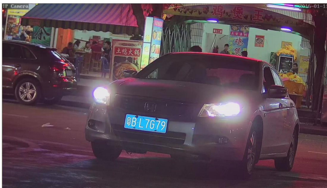
Speed of 15 kilometers per hour, high beam open