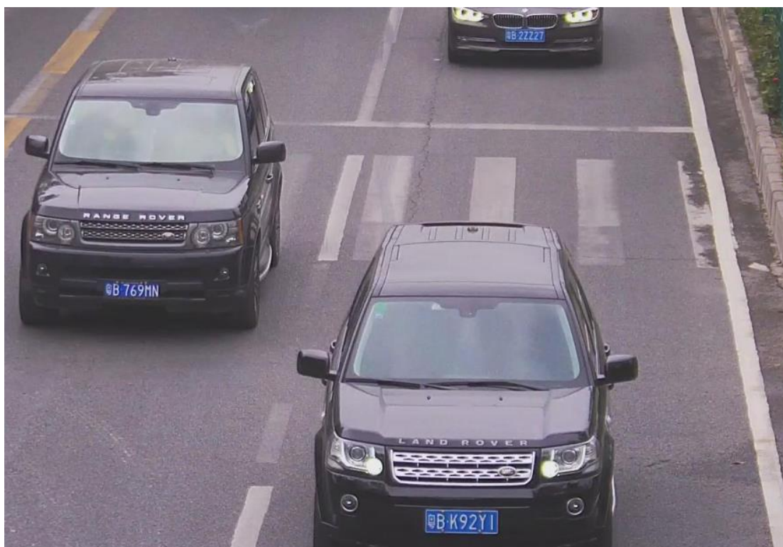
Xiangmi interchange live day video capture