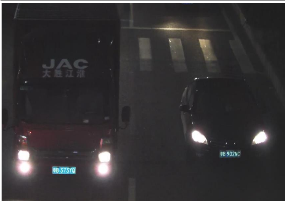
80 kilometers per hour Xiangmi Interchange

Global Sources Homepage Address: http://www.globalsources.com/ideacamera.co