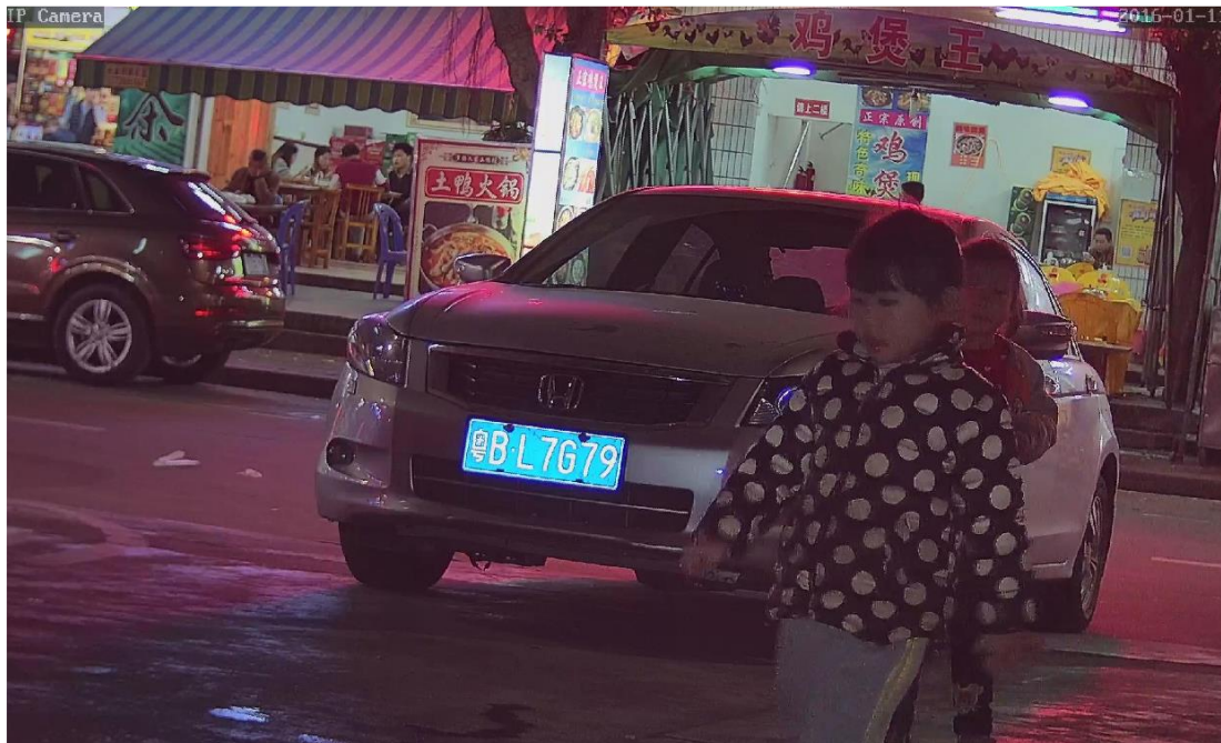
15 kilometers per hour, lights off